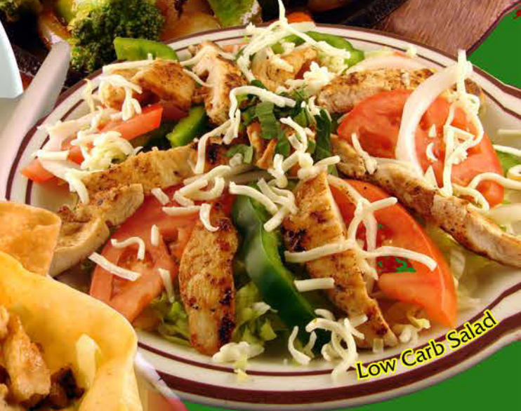
Low Carb Salad